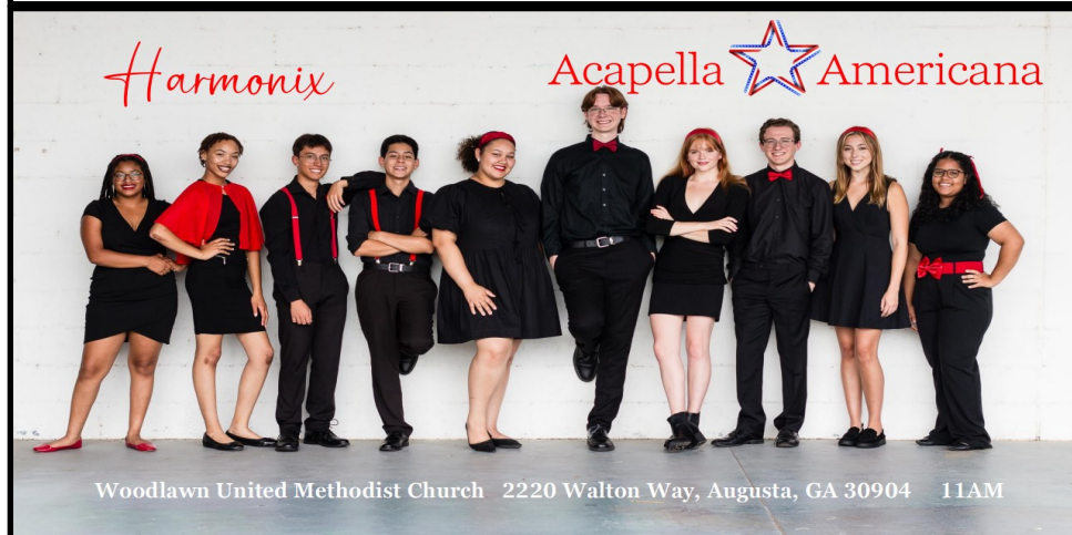
Woodlawn United Methodist Church 2220 Walton Way, Augusta, GA 30904 11AM

Today we welcome and thank Harmonix Acapella Americana Group from Davidson Fine Arts for joining us in worship this morning!! May their music raise you up in spirit!!